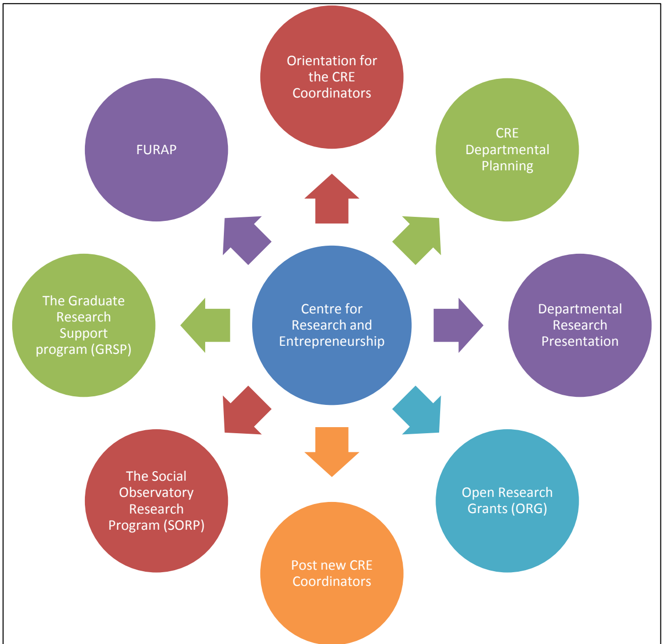
Figure 1: CRE's Action Plan for the Upcoming Academic Year

The following figure aims at demonstrating CRE's Action Plan for the upcoming academic year: