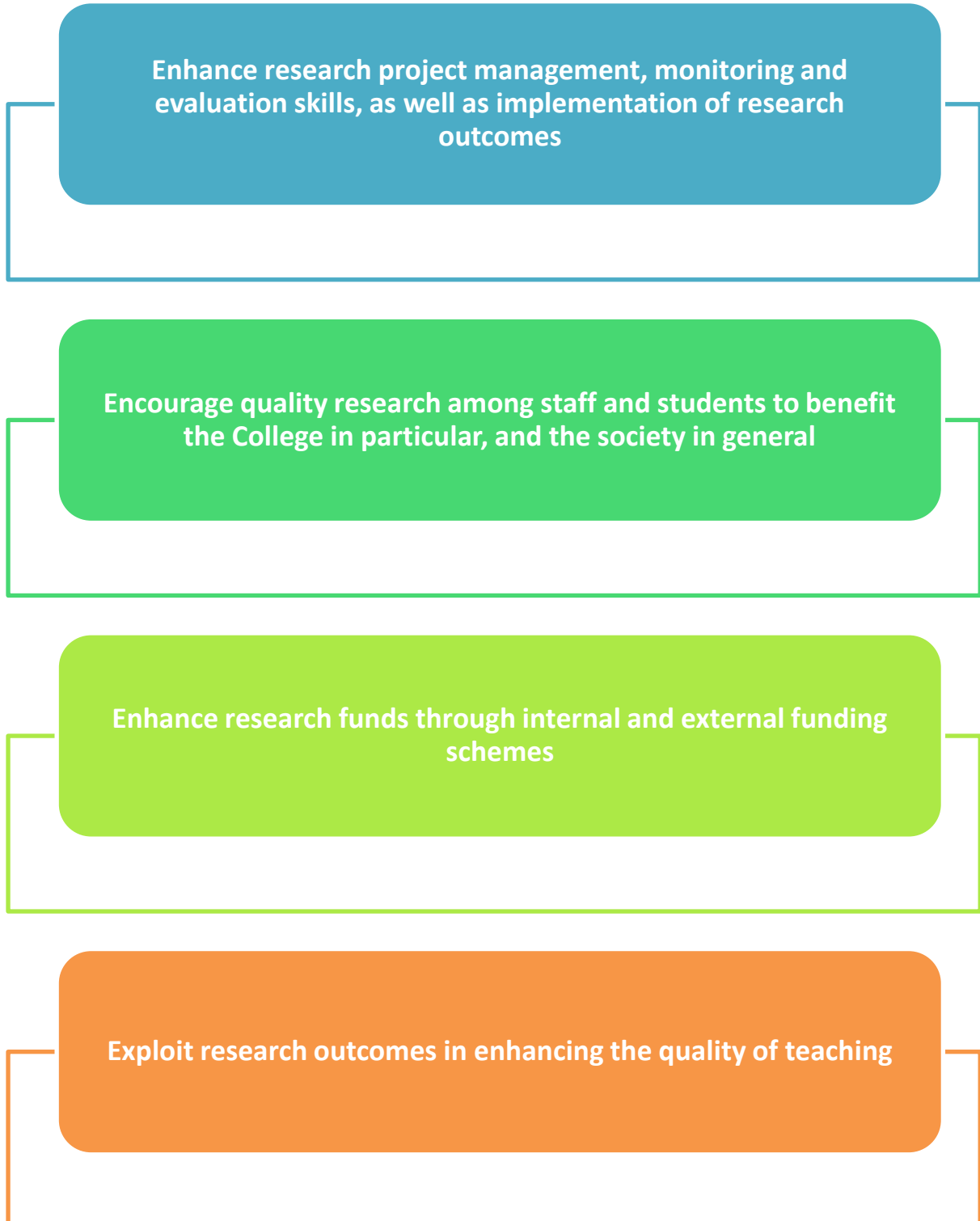
Figure 1: Gulf College Research Objectives

The following figure shows the research objectives of the College for the upcoming four years: